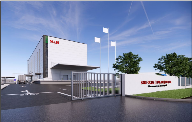
(Completed construction perspective rendering)