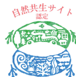
Figure 1: Logo for certification as a Natural Symbiosis Site

We transplanted and cultivated native species, including rare species that used to grow in the Tsukuba area, to create a local native plants biotope and continuously conduct monitoring surveys six times a year to ensure proper maintenance and management. This initiative, in particular, was recognized by the review committee as contributing to the improvement of biodiversity in the region, leading to the certification.