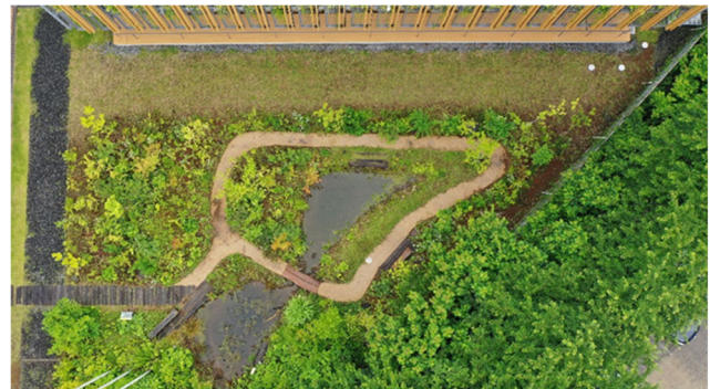
Photo2: “Tsukuba Regeneration Village”, the locality native plant biotope at the Tsukuba Technology Research Institute (photo taken from the sky)”

We are actively promoting the following two initiatives